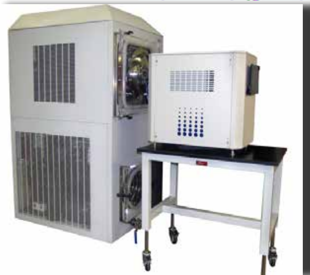
FreezeBooster NS20 (portable) attached to a Revo® Lab

The Millrock FREEZEBOOSTER® is a stand-alone module that can be attached to almost any laboratory freeze dryer. It does not require that the dryer have ASME rated chambers for high pressure and works within the parameters that the normal laboratory lyophilizer is designed for.